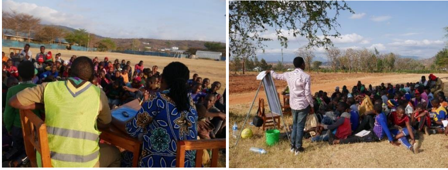
Figure 1. The pictures above shows some of Ilula Scouts learning about leadership