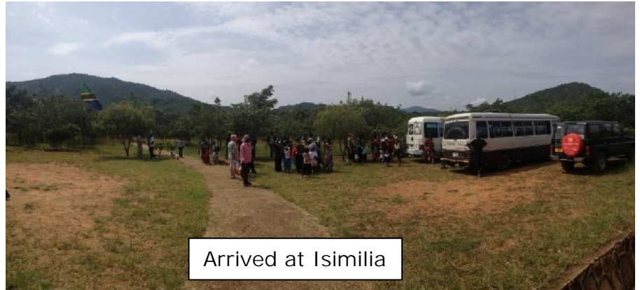
Arrived at Isimilia