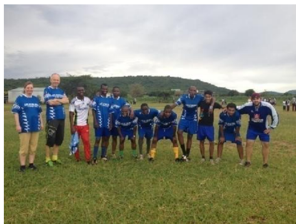
The Lords Hill Students + Engebraaten team VS IOP staff and YPP group team