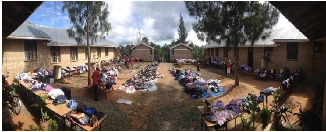
Everything is in place ready for people to come in