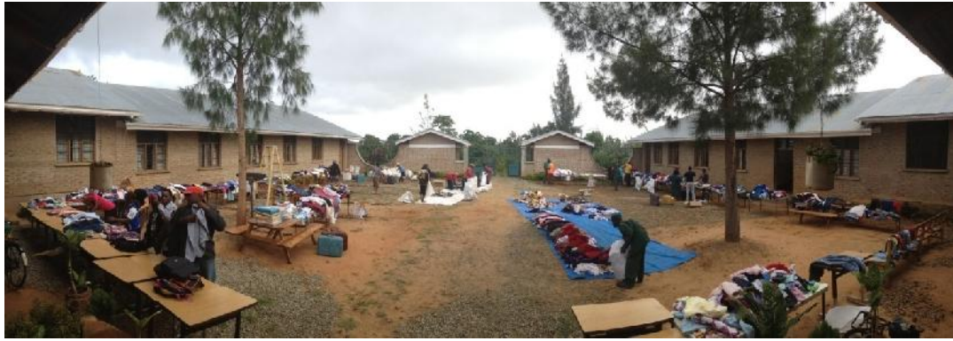
IOP staff and Volunteers arranging for the market