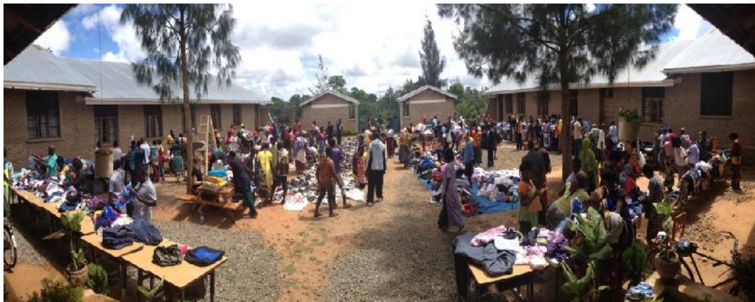
People purchasing clothes in the market