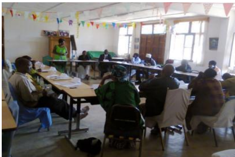
Photo showing Overnike giving training to community volunteers about GBV at IOP hall on 14th, September 2014

IOP is currently working in 50 villages in Kilolo District, in 16 of them there is a community volunteer who represents the number of Foster Families in the villages. Community volunteers have a big role of helping IOP to make sure that there is good communication between IOP and foster parents, foster children and village governments. Community volunteers normally observe and advice for good care of the orphans in the villages. They help ensures children's right are well practiced by foster parents. All children grow in good personality accepted by everyone in the community. Realizing that each community volunteer need to be empowered with some knowledge, IOP normally conduct capacity building trainings for community volunteers in the 16 villages. This is to remind them about children's rights, their duties as care givers to children. Other subjects may be psychology, how to document child abuse, and how to discourage physical punishment to children in primary schools. Training is also given to give awareness about Gender Based Violence (GBV). On 13/9/2014, the community volunteers were trained GBV at IOP hall. They presented difficulties and challenges which they face when doing community work. IOP was very thankful to all community volunteers for the good work they do for the children and encouraged them to keep up the spirit of volunteering because it is time to stand up and speak for those who are voiceless like children and the poor.